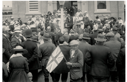
He whakanui i te rongomai ki Ōpunake 1918.

Ka whakamaumaharatia te rautautanga ki ngā hui me ngā mahi puta noa i te motu. Kei raro e rārangi mai nei ko ētahi whakaaro e whai wāhi mai ai koe ki tēnei wā whakahirahira.